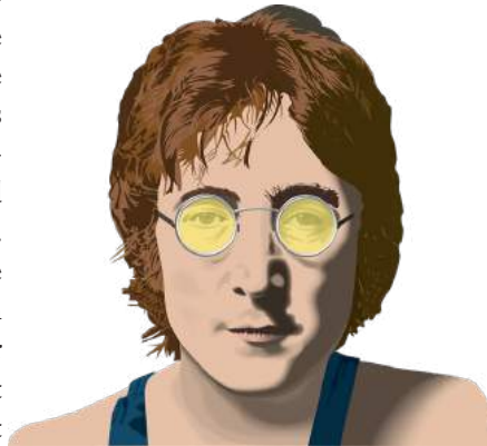
"Life is what happens when you're busy making plans."

John Lennon